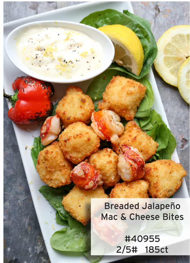
Breaded Jalapeño Mac & Cheese Bites

Whisk first 4 ingredients together and then add salt and pepper to taste. Zest with lemon. Deep fry Mac & Cheese Bites in 350°F oil for 3-4 minutes. Plate with lobster over a bed of greens.